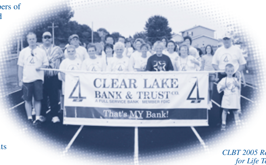
CLBT 2005 Relay for Life Team